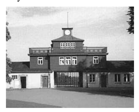
Buchenwald Concentration Camp

In the previous article of this series we traced out how the Final Solution came to be and to be implemented by the Nazis. All told, about 11,000,000 people died at the hands of the Nazis, including priests, ministers, Roma and Sinti gypsies, Russian POWs, the Polish intelligentsia and 6 million Jews. Many were killed in the camp system established by the Nazis. The concentration camp system began soon after Hitler rise to power in January of 1933.